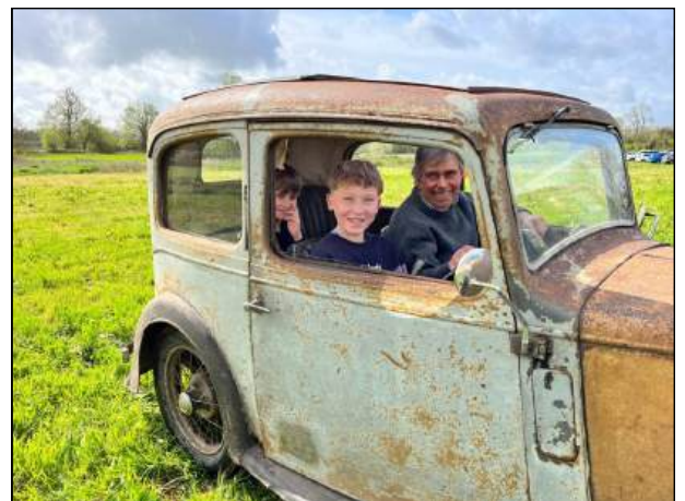
A reminder of the 'Young Drivers' Day' held earlier this year.