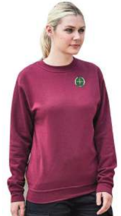
Sweat Shirt £24. 13 Colours available.