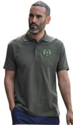
Polo Shirt £20. 17 Colours available.