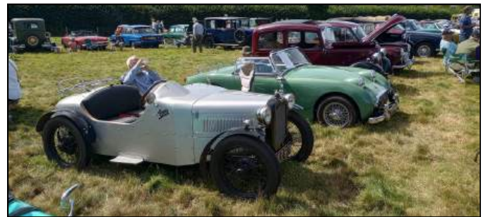
Several DA7C members met at the Chagford Show