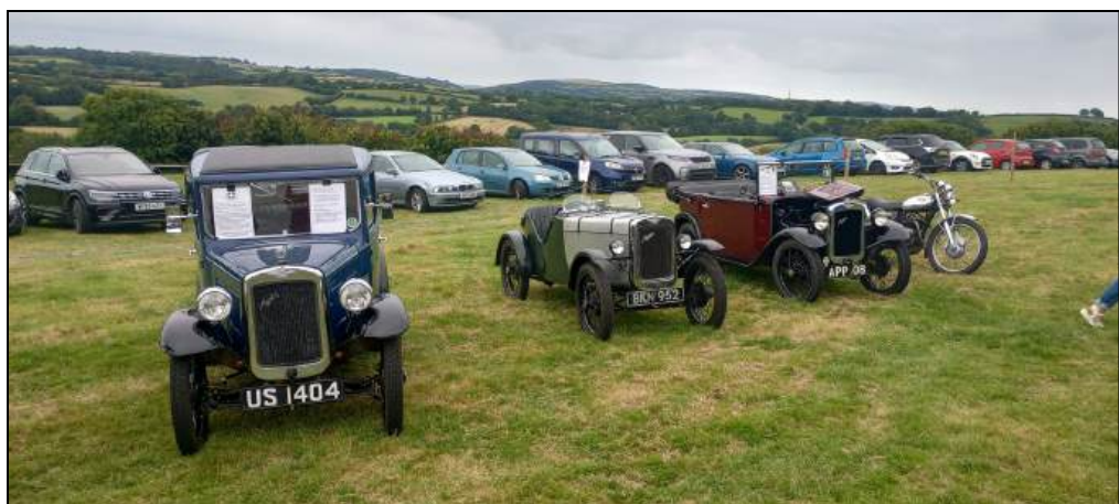
Lovely views from the Throwleigh Village Fete.