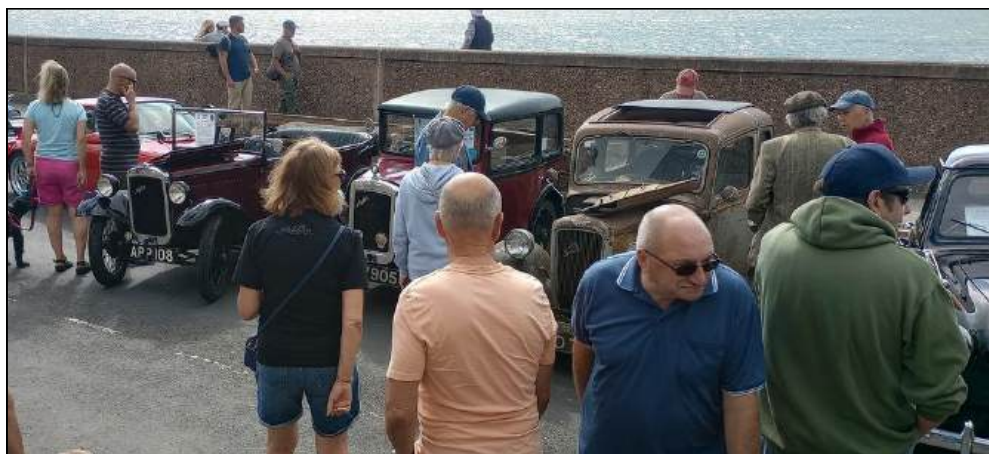
Austin 7s attracted a lot of attention at Seaton