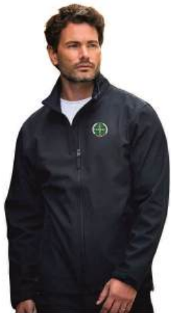
Soft Shell Jacket £35. 3 Colours available.

All clothing items are available from our new On-Line Shop.