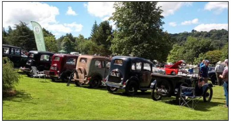
A beautiful setting and lovely weather for the Rosemoor Vintage Weekend.