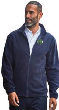
Fleece Jacket £35. 3 Colours available.