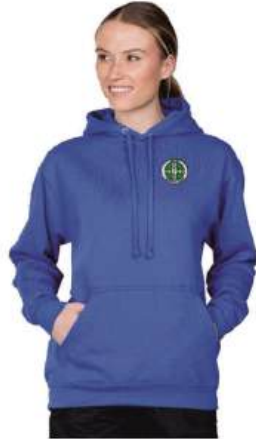
Pull-Over Hoodie £28. 8 colours available.