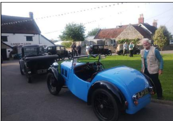
A glorious evening attracted 8 Sevens to the Lamb and Lion, Hambrdige for the Somerset Seveners monthly noggin and natter. Carburettors, oil leaks and dashboard mounted flower vase dominated the chat.

Several DA7C members joined up for the 'All things Morris' weekend in Ilfracombe.