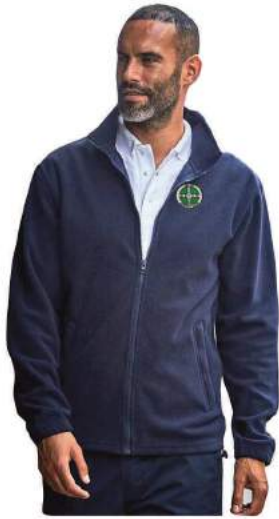
Fleece Jacket £35. 3 Colours available.