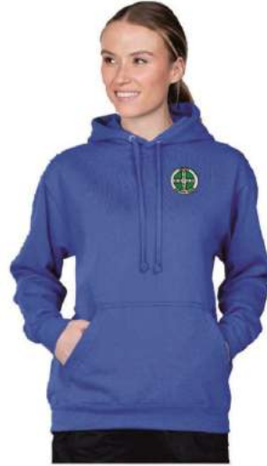
Pull-Over Hoodie £28. 8 colours available.