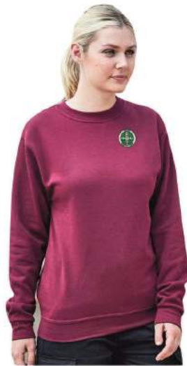
Sweat Shirt £24. 13 Colours available.