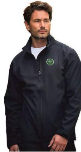
Soft Shell Jacket £35. 3 Colours available.

All clothing items are available from our new On-Line Shop.