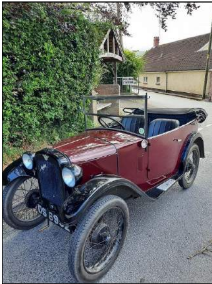
Jude took Gladys when she went out to vote.