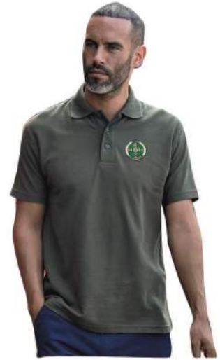
Polo Shirt £20. 17 Colours available.