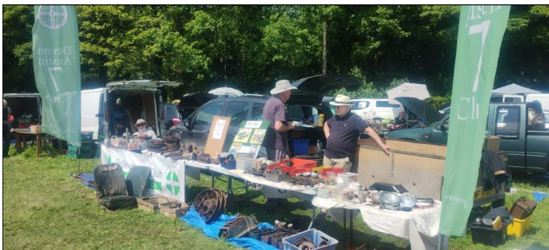
The DA7C stand at the Devon Vintage CC Autojumble held in May at Buckfastleigh