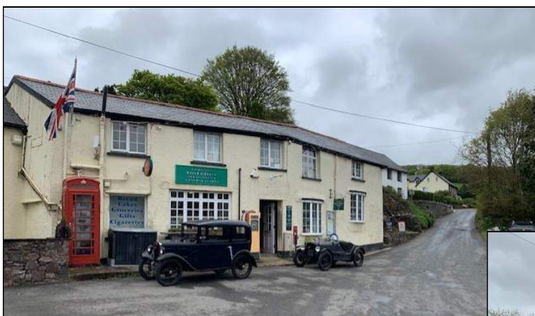
Refreshment stop at Withypool